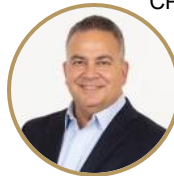
Immediate Past President